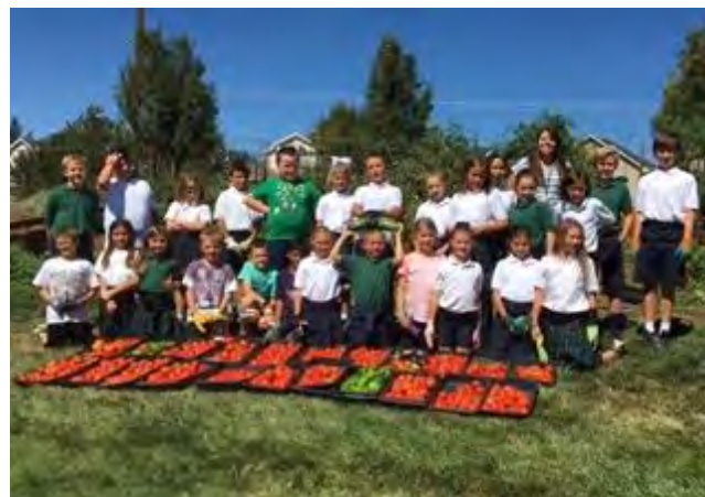
GETTING READY FOR FALL FEST!

Our Fourth Grade was busy last week harvesting the garden to sell produce at Fall Fest. Sales brought in $430 for the Parish food Bank.