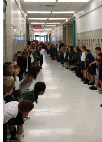
SJB Elementary gathered together last Friday for school-wide prayer in recognition of the National Day of Prayer for World Peace!